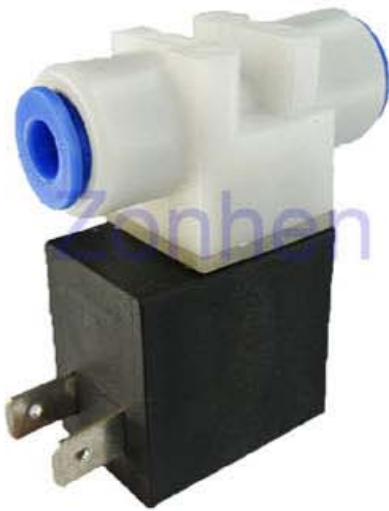
总重量 Total Weight: 89g 应用范围: 自动取款机 APPLICATION: ATM

ISO/TS16949 ISO9000 ISO14000 RoHS REACH CE UL VDE TÜV